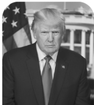
President Donald J. Trump

President Donald J. Trump is expected to be the Republican nominee for president. He was elected in 2016. According to the U.S. Constitution, he is allowed to serve one more four-year term.